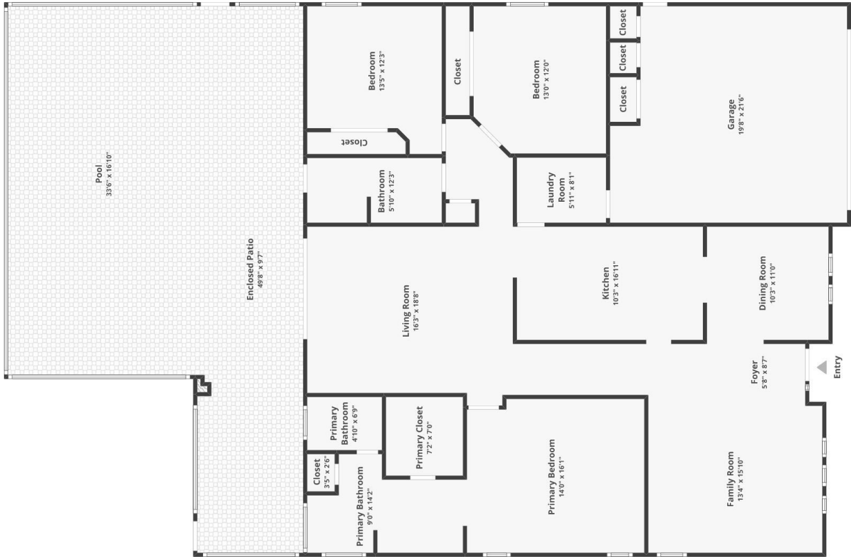
1001 Pelican Ln, Rockledge, FL 32955 Floor 1

Floor plans/tour cannot be used for building or design purposes. Sizes and dimensions are approximate.